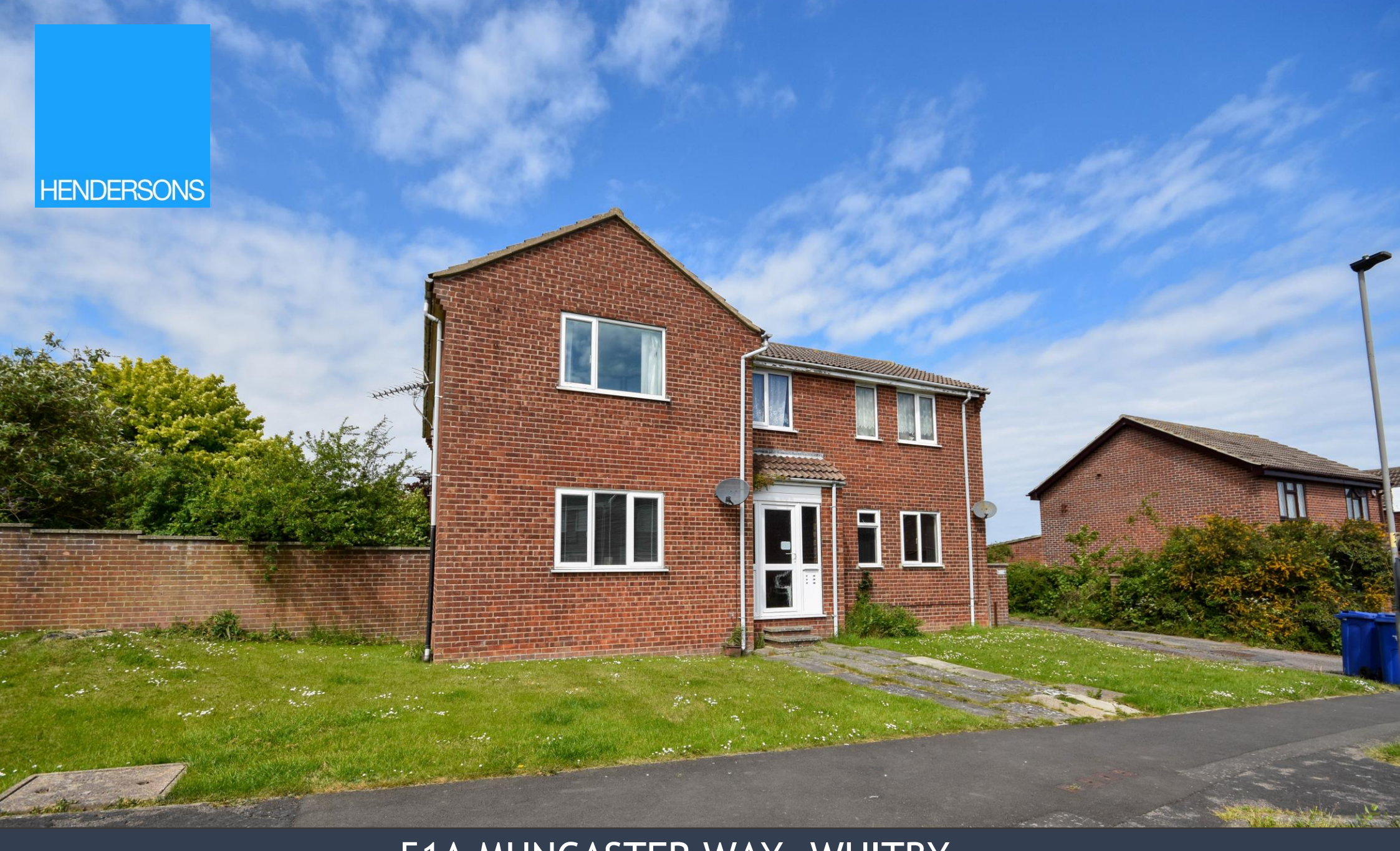
51A MUNCASTER WAY, WHITBY Guide Price £85,000